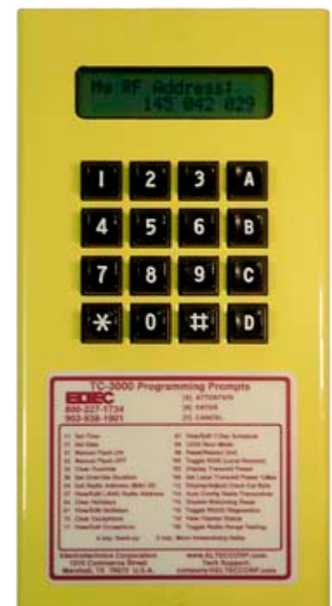
TC-3000 (time clock)