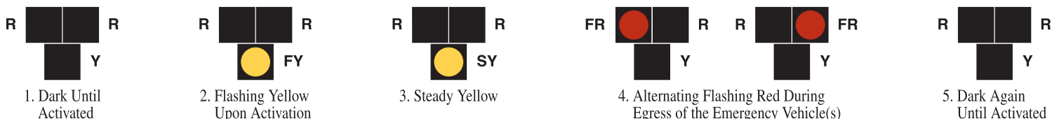
FY-Flashing Yellow • SY-Steady Yellow • FR-Flashing Red OPTION: A "Steady Red" clearance interval may be used after a "Steady Yellow."