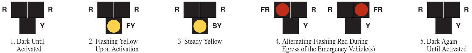
FY-Flashing Yellow • SY-Steady Yellow • FR-Flashing Red OPTION: A "Steady Red" clearance interval may be used after a "Steady Yellow."