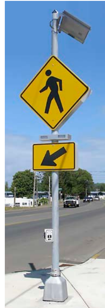
Wrap-around RRFB Light Bar with Required Signage