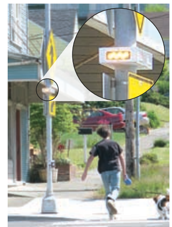
RRFB with Pedestrian Verification Light