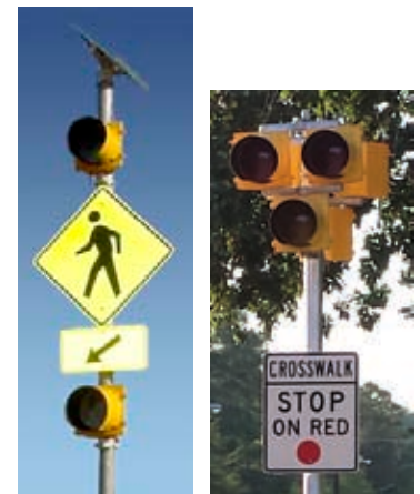
Standard and Hawk Mid-block Pedestrian Crossings