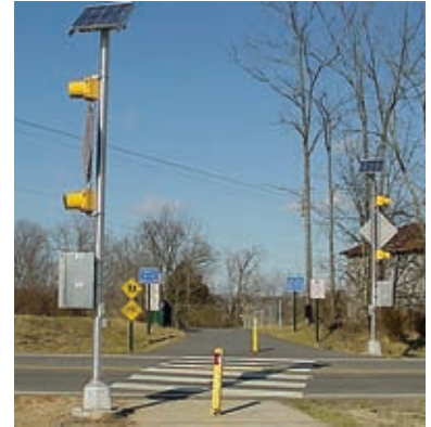
Rural Bike and Pedestrian Crossing